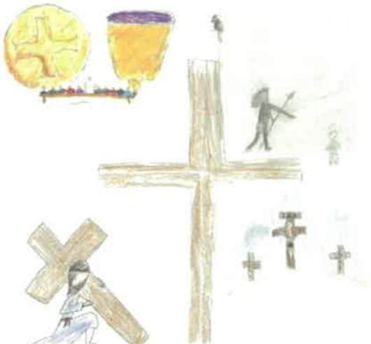
(Front cover picture drawn by Eighth Grade student)