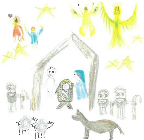
(Front cover pieces drawn by Seventh & Eighth Grade students & Gabriel)